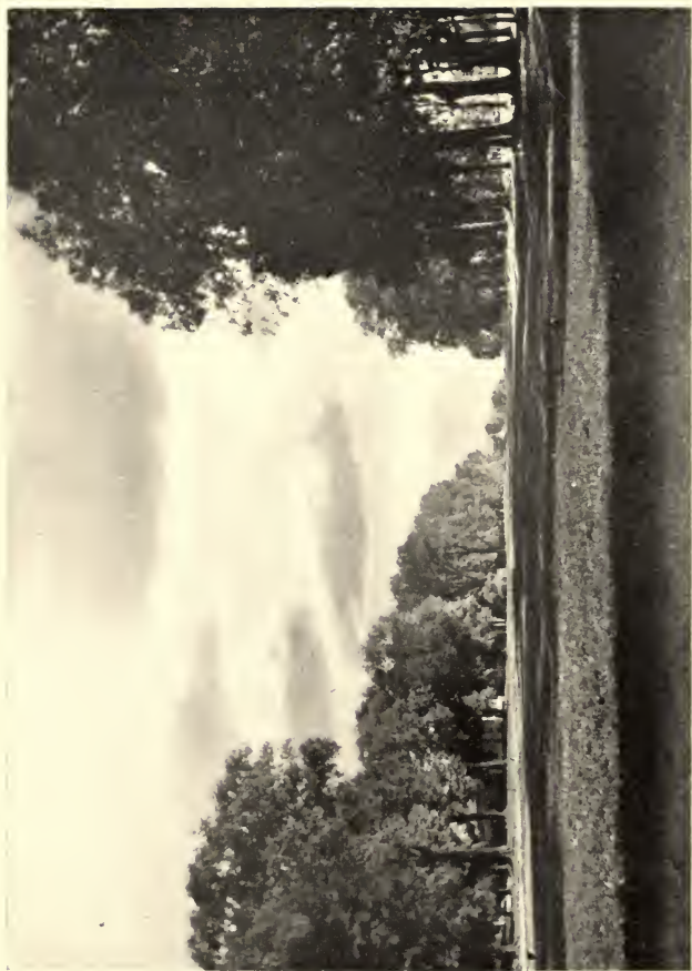
OLD HADLEY STREET, LOOKING SOUTH